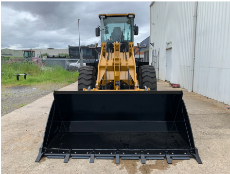
Stylish Design With Good Lighting