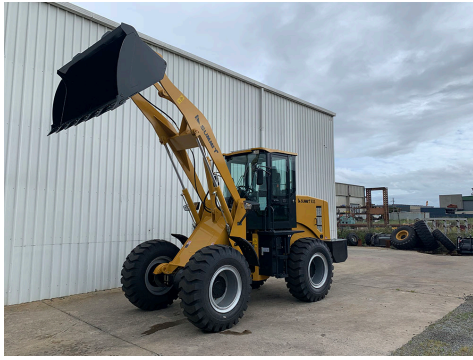
3.5m Dumping Height