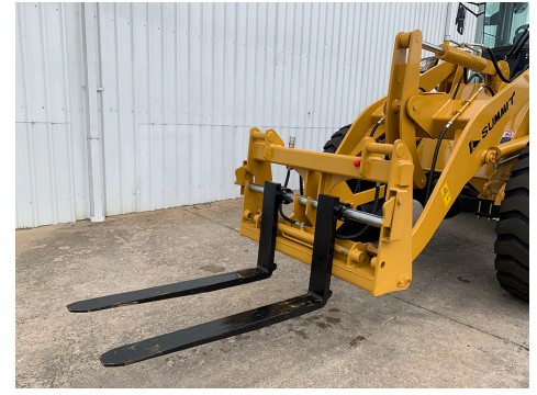
Strong JCB Style Quick Hitch