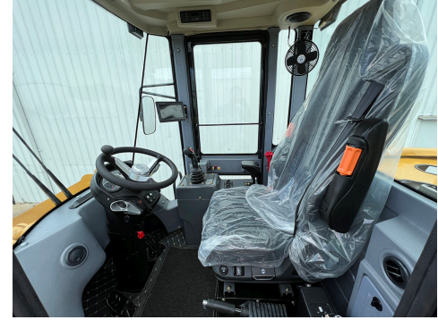
Large Comfortable Cabin With Comfortable Seat & Strong A/C