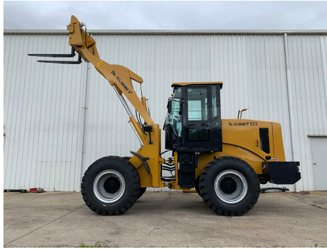
4m Lifting Height