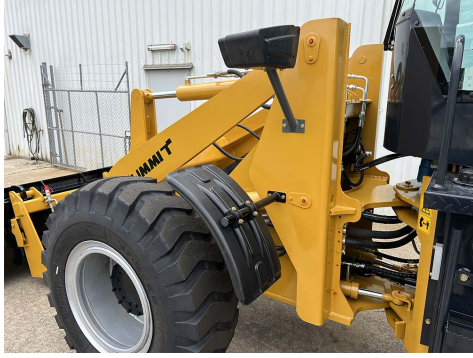
CAD Design Solid Structure