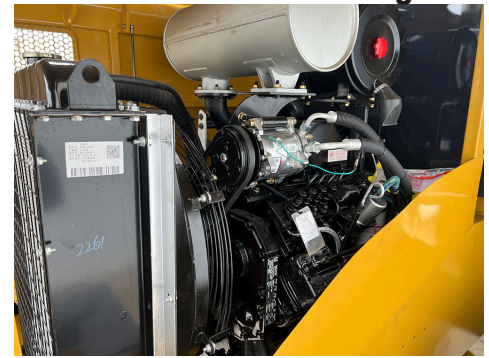
Genuine Cummins Motor With Cummins Backed Warranty