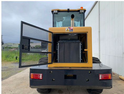
Design & Build For Australian Environment With Excellent Serviceability